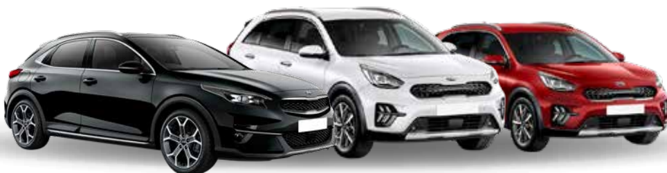
Vehicles images are for illustrative purposes only

Managing your fleet's mobility has never been easier